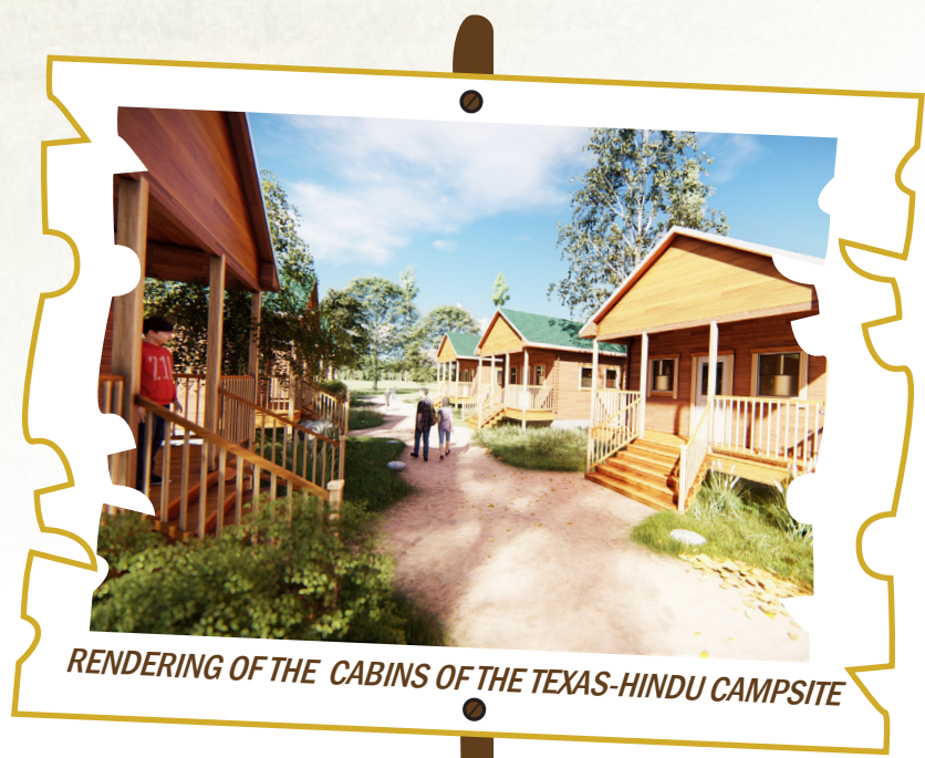
RENDERING OF THE CABINS OF THE TEXAS-HINDU CAMPSITE