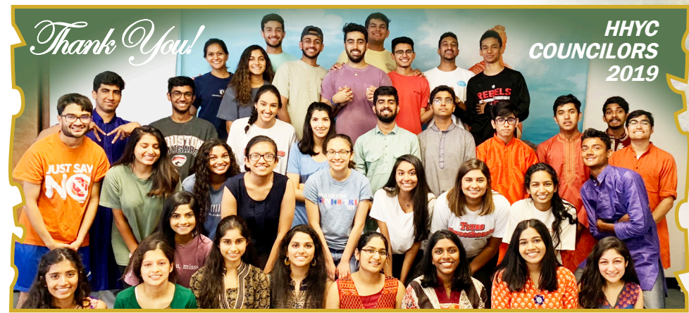
Non-Profit, Tax Exempt 501(C)3 Organization (84-3444788)

Please make check payable to "Texas Hindu Campsite" and send your Tax Deductible contributions to: Texas Hindu Campsite 40 Harbore View Drive, Sugar Land, TX 77479